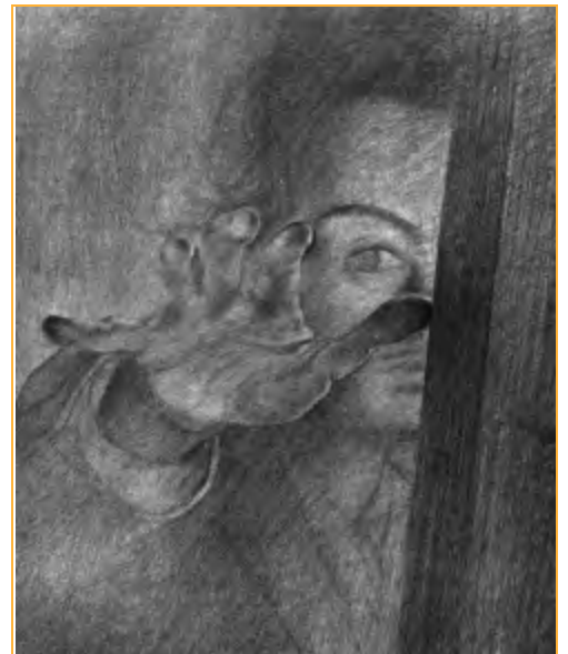
Dalí - Study for Self Portrait, 1938