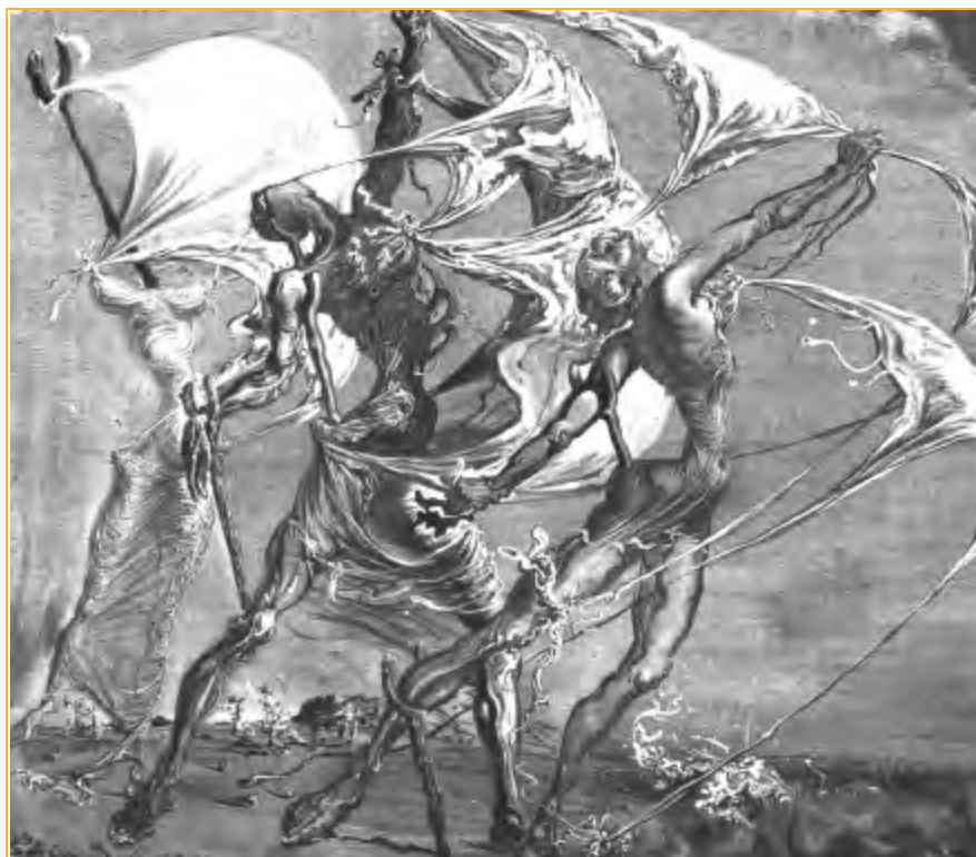
Three Women Imitating the Movements of a Sailing Boat, 1940

"It was prophesied that removed from the stimulus of Paris I would end by immobilizing myself in a nostalgic waiting for a return. "I believe I have already disproved this by categoric arts: America has only developed, to the extent of a paroxysm, one of the most characteristic and almost monstrous `secrets' of my personality - my capacity for work."