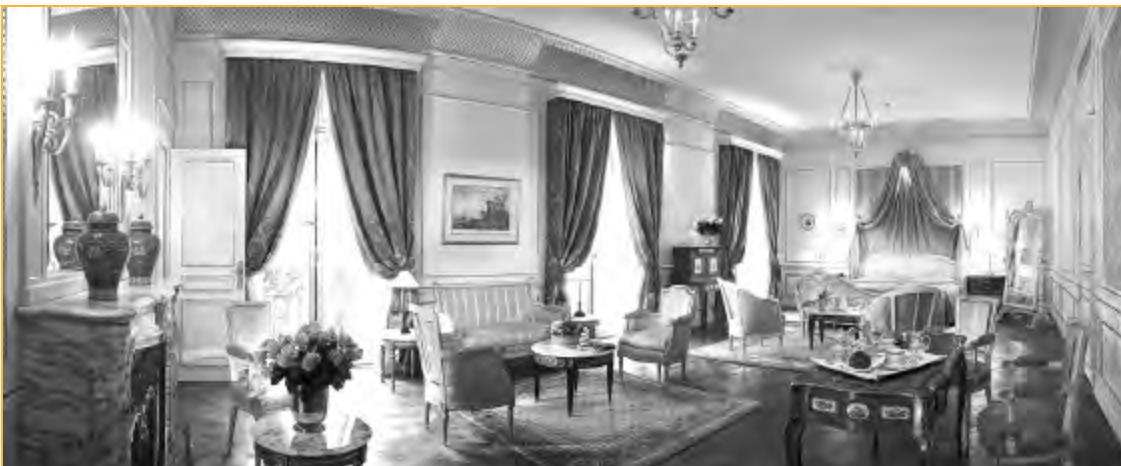
Dali's Suite - The Meurice, Paris

Incidentally, under the King Cole bar where Dali used to hold court, was an area that once a week was transformed into an ice rink which was in those days unique to a New York hotel. Further -- and this is probably a coincidence -- the St. Regis opened its doors in 1904, the year of Dali's birth. Dali's old suite, #1610, has since been refurbished and is now called "The Presidential Suite."