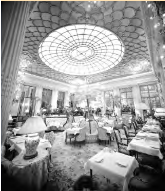
The Meurice, Paris