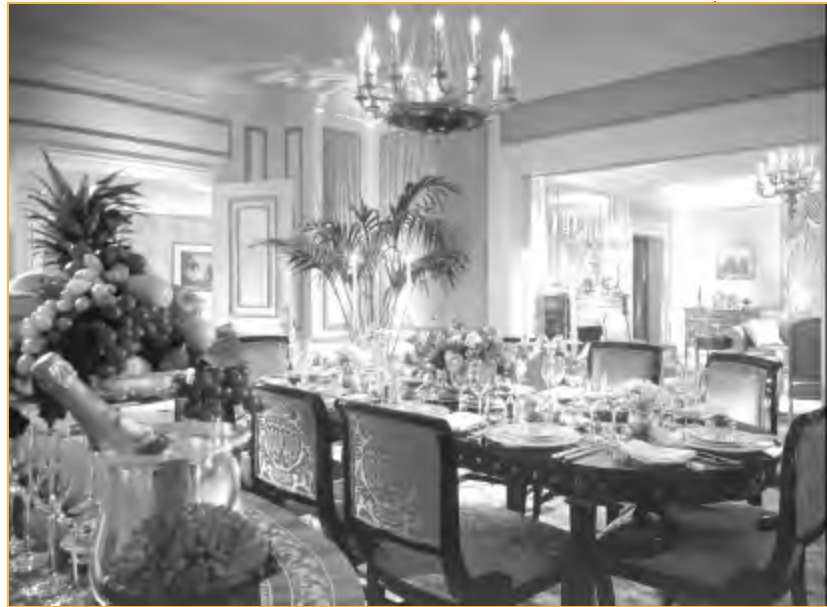
The St. Regis Hotel, New York

The Meurice, apart from being one of the best hotels in Paris (I should know, I used to work there), had been the home for a while of King Alphonso XIII, the last king of Spain before Franco took over. This obviously appealed to Dali, and he always occupied the same "Royal" suite (106-8) as the king did. As Dali once said, "the divine arse sits on the same