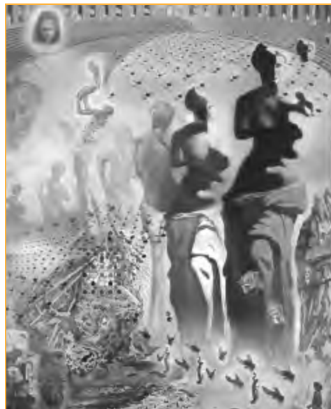
The Hallucinogenic Toreador