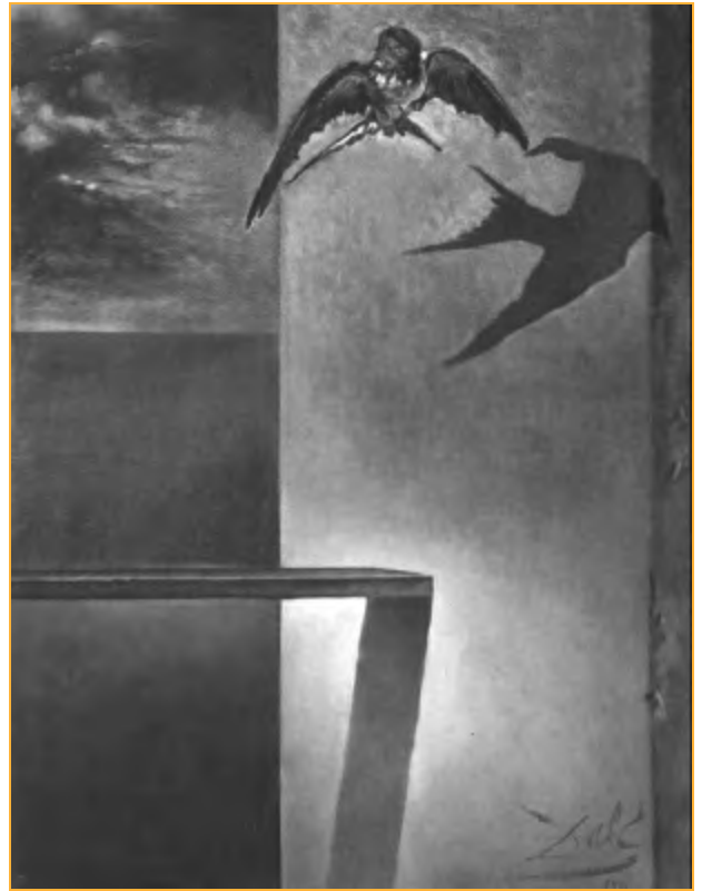
The Motionless Swallow, 1956

The painting had then been taken to several European countries, and one of the three suspects attempted to auction the work in London on June 25 last year through Sotheby's auction house.